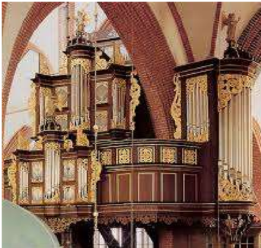
Orgue Arp Schnitger Style Baroque 46 jeux 3 claviers Construction 1686